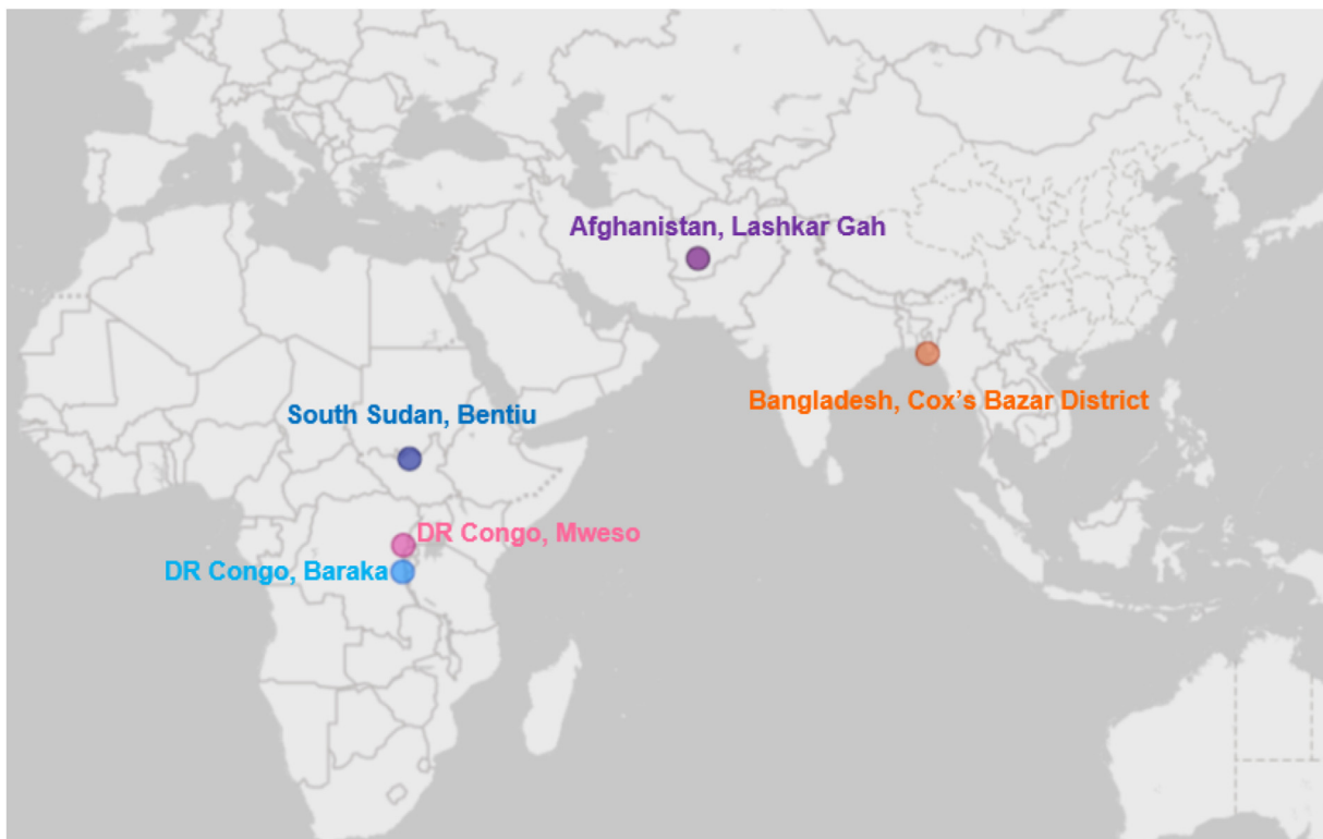
Figure 1. Geographic locations of research settings.

First, all the data was plotted to understand emerging patterns as ARIMA modelling in time series requires stationary