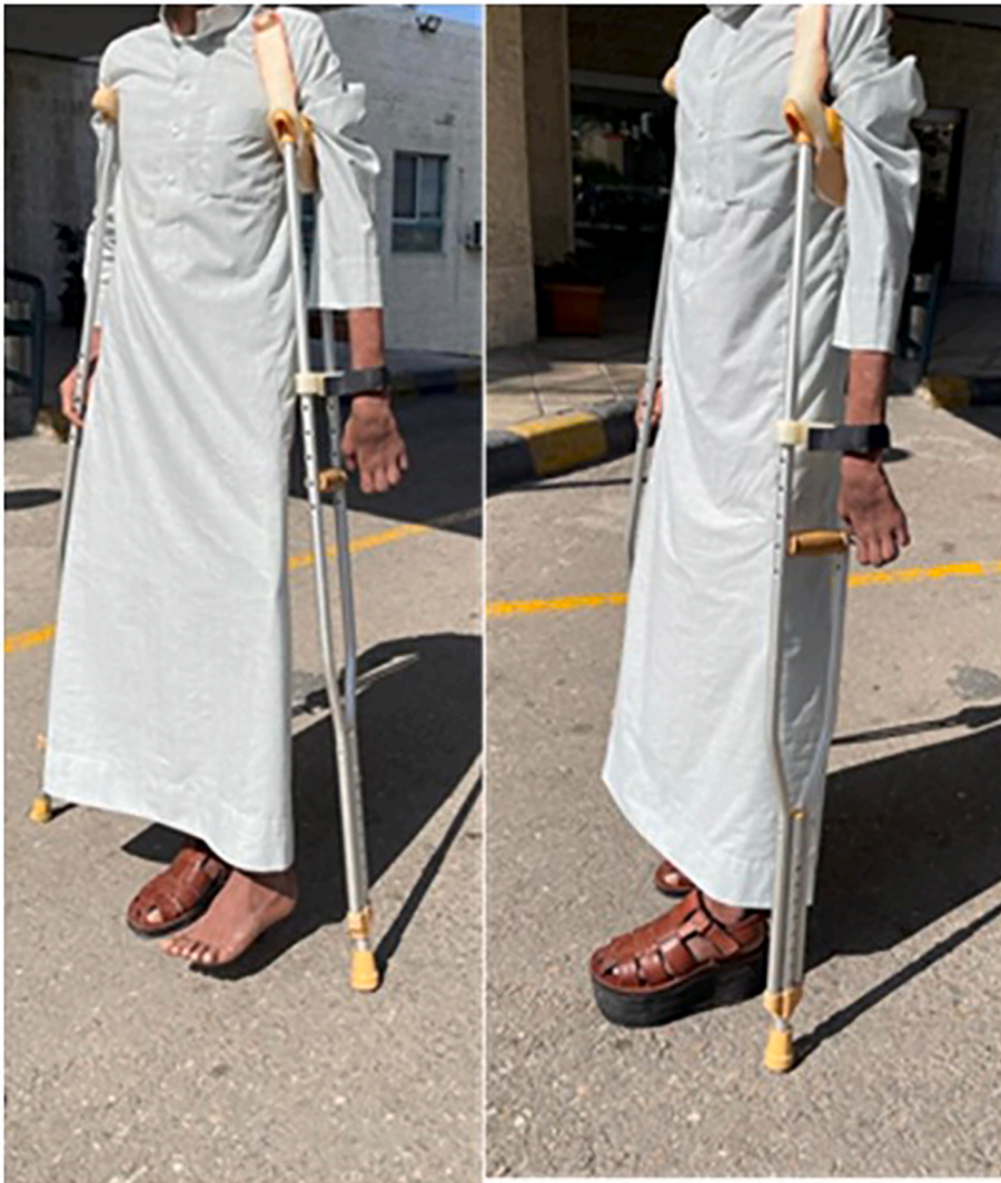
Fig. 3. The patient using the crutch, full and partial weight bearing.