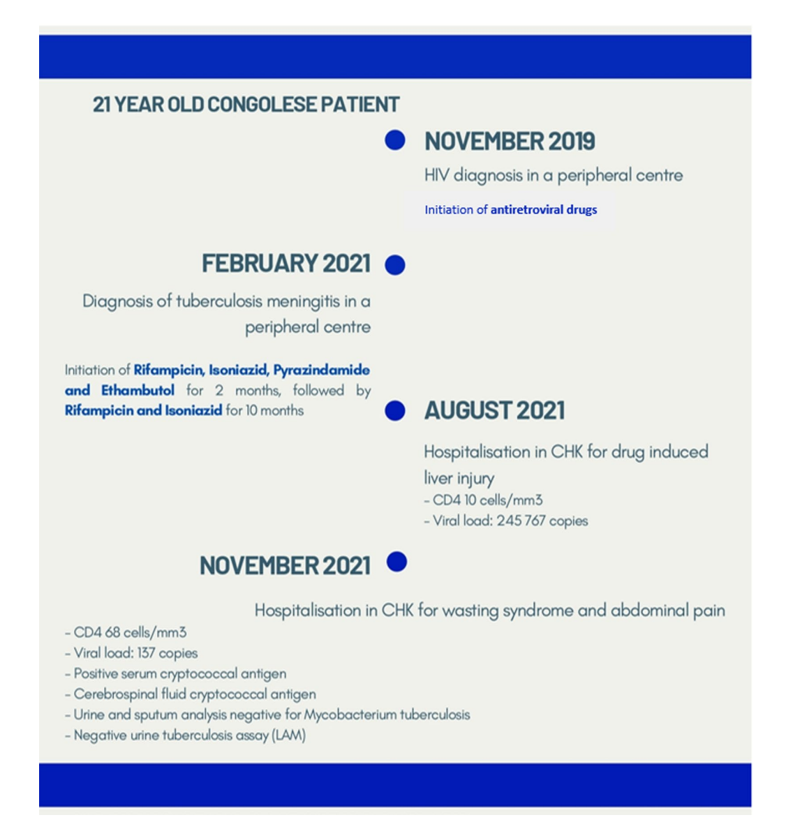
Fig. 1 Patient timeline prior to hospitalization in November 2021

The patient history revealed that initial symptoms were dominated by headaches. The initial clinical presentation and the investigations relevant to the initial diagnosis, as well as cluster of differentiation 4 (CD4) cells and viral load at treatment initiation are all unknown. The TB meningitis diagnosis and treatment were initiated at another center as per Congolese guidelines. National guidelines for tuberculosis meningitis recommend treatment for 12 months with an intensive phase of quadruple therapy (rifampicin, isoniazid, pyrazinamide, and ethambutol) for 2 months, followed by rifampicin and isoniazid for 10 months [3]. Neurological symptoms improved soon after the initiation of treatment.