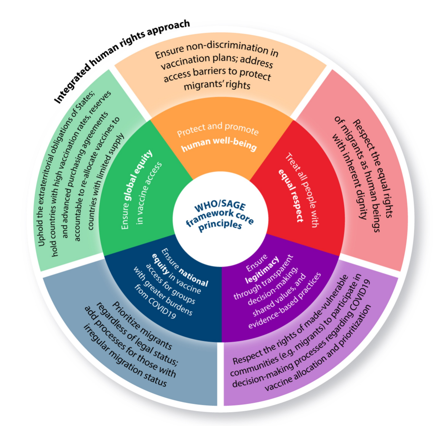
Fig 1. Integrating human rights into a modified WHO/SAGE framework to address the unmet COVID-19 needs of migrants