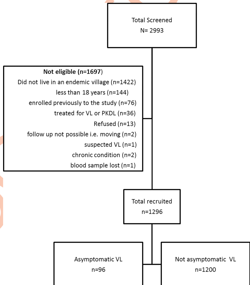
Fig 1. Flow diagram showing recruitment of study participants in Bihar, India between May 2018 and June 2019.

A total of 2,993 individuals were screened, of those, 1,697 individuals did not meet the inclusion criteria and were excluded from the study (Fig 1).