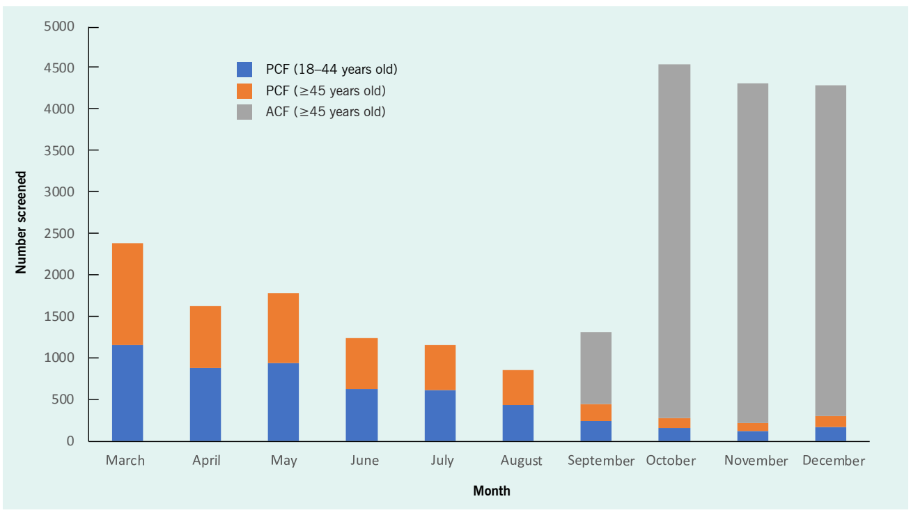
Fig. 1. Numbers of cases screened in the passive and active screening programmes by age group and month, Maung Russey operational district, Cambodia, March-December 2018

PCF: passive case finding; ACF: active case finding.