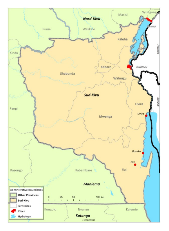
Figure 3: Map of South Kivu, DRC (with Baraka highlighted)<sup>20</sup>