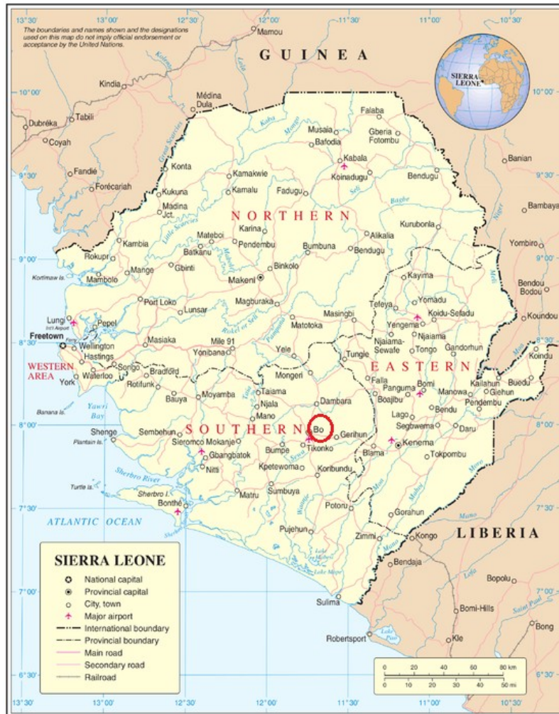
Figure 1: Geographical position of Bo District (red circle around Bo town)