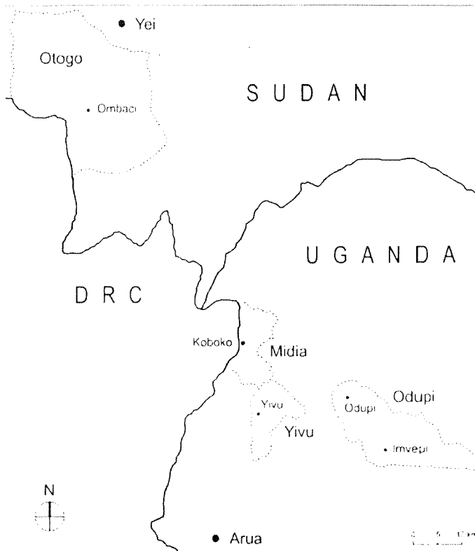
Figure 1: Sudanese and Ugandan sub-counties surveyed by the Demography of Forced Migration Project, 1999-2000.

Sample size calculation was based on available under-5 mortality figures so as to calculate the most conservative figure possible. Calculations were made for comparing populations with a design effect factor to account for deviations from a simple random design. In total, 3,371 individuals from 1,842 households were interviewed providing sufficient power for statistical analyses. Analysis was restricted to 3,323 individuals for whom complete data was available.