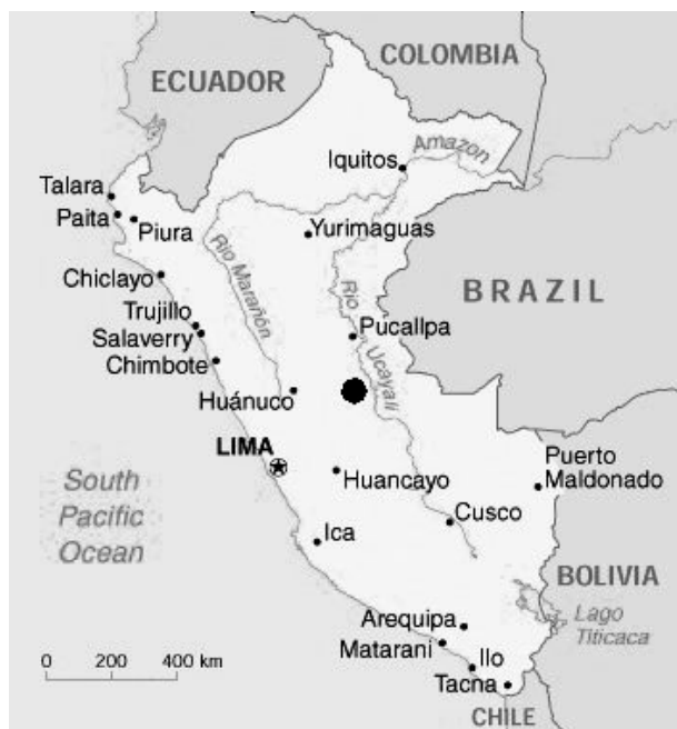
Figure 1 Area of the project (●).

The general objective of the project involving these three institutions was to decrease morbidity caused by MCL through improved case management of patients in San