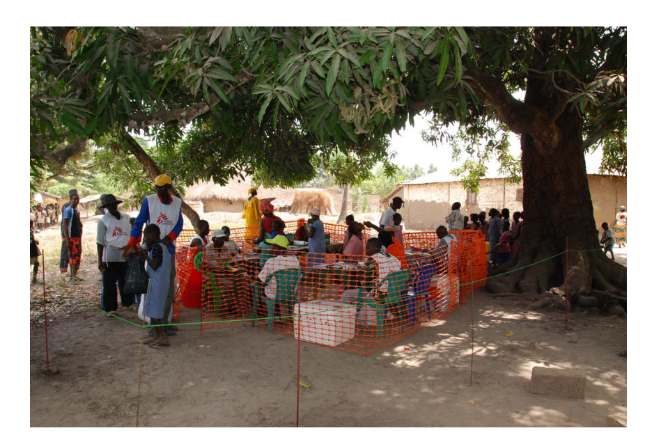
Figure 1. Vaccination team at work. Image credit: David Di Lorenzo . doi:10.1371/journal.pmed.1001512.g001

Teams vaccinated an average of 703 persons daily, up to 1,830 vaccinations/ day/team. They spent several days in the larger villages but covered several smaller sites in one day. The vaccine wastage rate was below 1%. A total of 46 non-severe