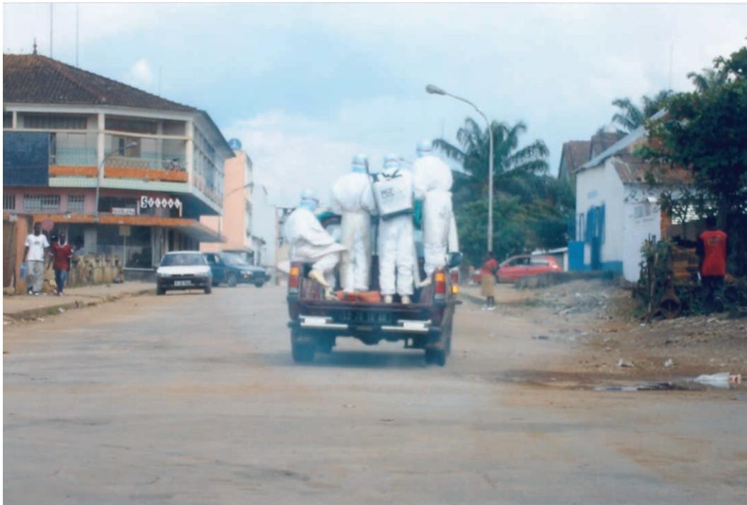
Figure 1. To be avoided: burial team driving to a household already fully dressed in personal protective equipment. The better practice is to dress in front of household members.

somewhat different protocol for the same activities [11]. Although the MSF protocol was technically sound, it failed to emphasize the importance of incorporating local traditions and addressing the psychological and spiritual needs of families in the burial and disinfection process. Furthermore, MSF did not always explain activities to bystanders and the community at large before performing procedures. The protocol employed by the WHO, although more time consuming in its execution, contained the culturally sensitive aspects missing from the MSF protocol.