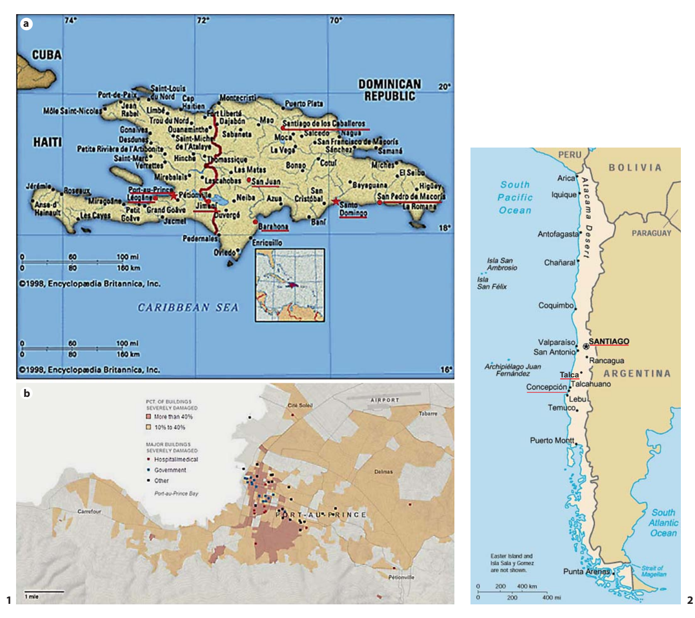
Fig. 1. a The geographic situation of the island of Hispaniola. Haiti is in the west, and the DR is in the east; the following cities are underlined: in Haiti, Leogâne (the epicenter) and Port-au-Prince (the highly affected capital); in the DR, Jimani and Barahona (border cities where the most important influx of victims from Haiti took place), and Santo Domingo, Santiago, San Pedro, and San Juan (where most of the dialysis activities took place). b City

map of the metropolitan area of Port-au-Prince showing the damaged major buildings. The colored areas reflect severely damaged zones; light shade = 10-40% of buildings damaged; dark shade = more than 40% of buildings damaged [14].