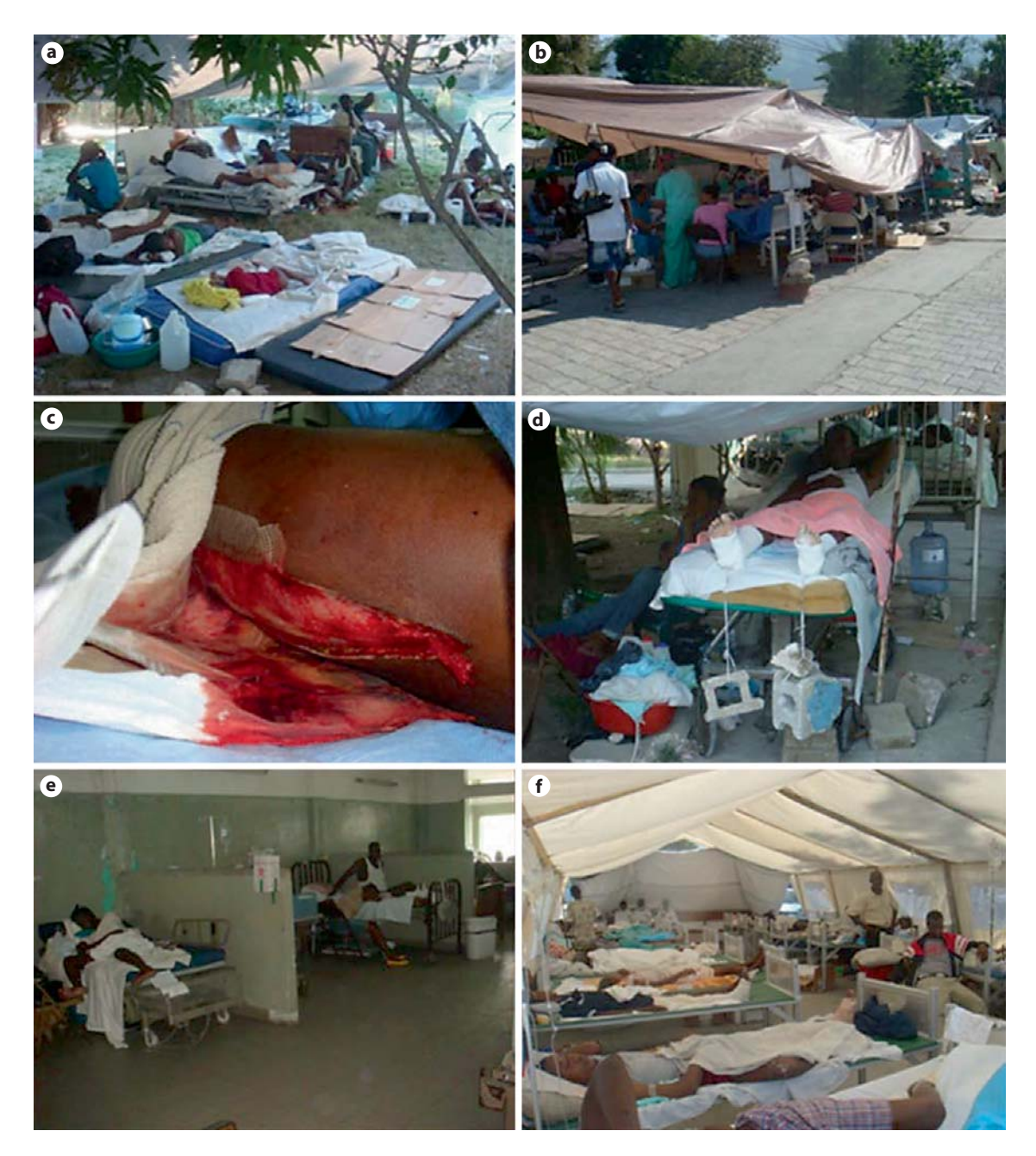
Fig. 6. Local conditions in Port-au-Prince in the first days after the disaster. a , b Wounded people lying outside in the open air. c Crush wound. d , e In-hospital conditions. f A newly erected tent for medical care.

Transport within Port-au-Prince was also heavily disrupted due to severe infrastructural damage, roads being blocked by movements of people and material, and initially, by corpses and wounded people lying in the streets (fig. 6a, b). This hampered missions for the screening of kidney function and communication with other hospi-