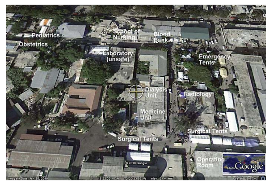
Fig. 3. Google Earth image of the campus of the University Hospital (HUEH in Portau-Prince). The location of each of the buildings is indicated. The picture focuses on the dialysis unit in the center with the MSF Land Cruiser (white vehicle) parked outside. Some of the buildings were destroyed by the earthquake, e.g. the nursing school where more than 50 students were killed. The laboratory building was declared geologically unsafe. Patient care was in part delivered in tents (foreground).