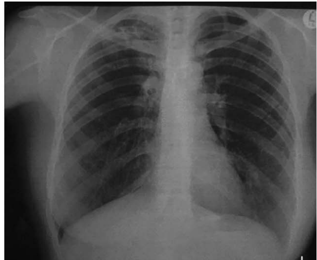
Figure Chest X-ray during respiratory tract infection (left) and following resolution of symptoms (right) for Case 1.

sampling was again Xpert-positive with RMP resistance, but TB liquid culture was negative. The patient did not receive anti-tuberculosis treatment, and she remained clinically well 5 months after initial presentation.