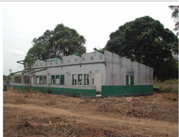
Figure 2 Loulambo, Pool region, Republic of Congo, 2003; a maternity ward destroyed by conflict.

Additional file 1, Table S1 shows programme contexts and settings. 22 programmes were in sub-Saharan Africa. Thirteen were classed as conflict and eleven as post-conflict. Most (21) were in rural locations including two in refugee camps. Most countries had endured decades of instability, with conflicts lasting an average of 18 years; MSF had typically been present for 17 years. Additional file 1, Table S1 shows estimated WHO/UNAIDS country