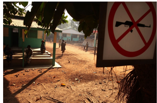
Figure 1 An MSF clinic in Kabo, Central African Republic, 2007; with a sign indicating "no guns allowed in the clinic".

An HIV programme was initiated in Bukavu, a conflict-affected region of eastern Democratic Republic of Congo (DRC) in October 2003 and expanded to 24 basic health-care programmes in 12 countries (Figure 4). We describe the contexts, activities, outcomes, challenges, and lessons learned from these programmes, including answers to common issues raised about potential difficulties in implementing such programmes. Our aim is to share the knowledge and experience obtained by MSF and its counterparts and to facilitate and advocate increased commitment for provision of HIV treatment in these settings.