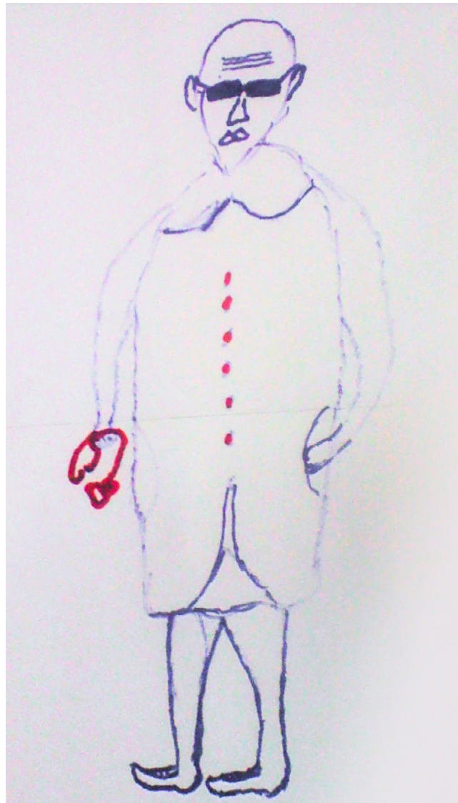
Figure 1. Depiction of a clinician drawn by ALHIV during PLA group activities.

There were also multiple examples of young people, or their caregivers, being scolded when they did admit to missing doses of their medication: